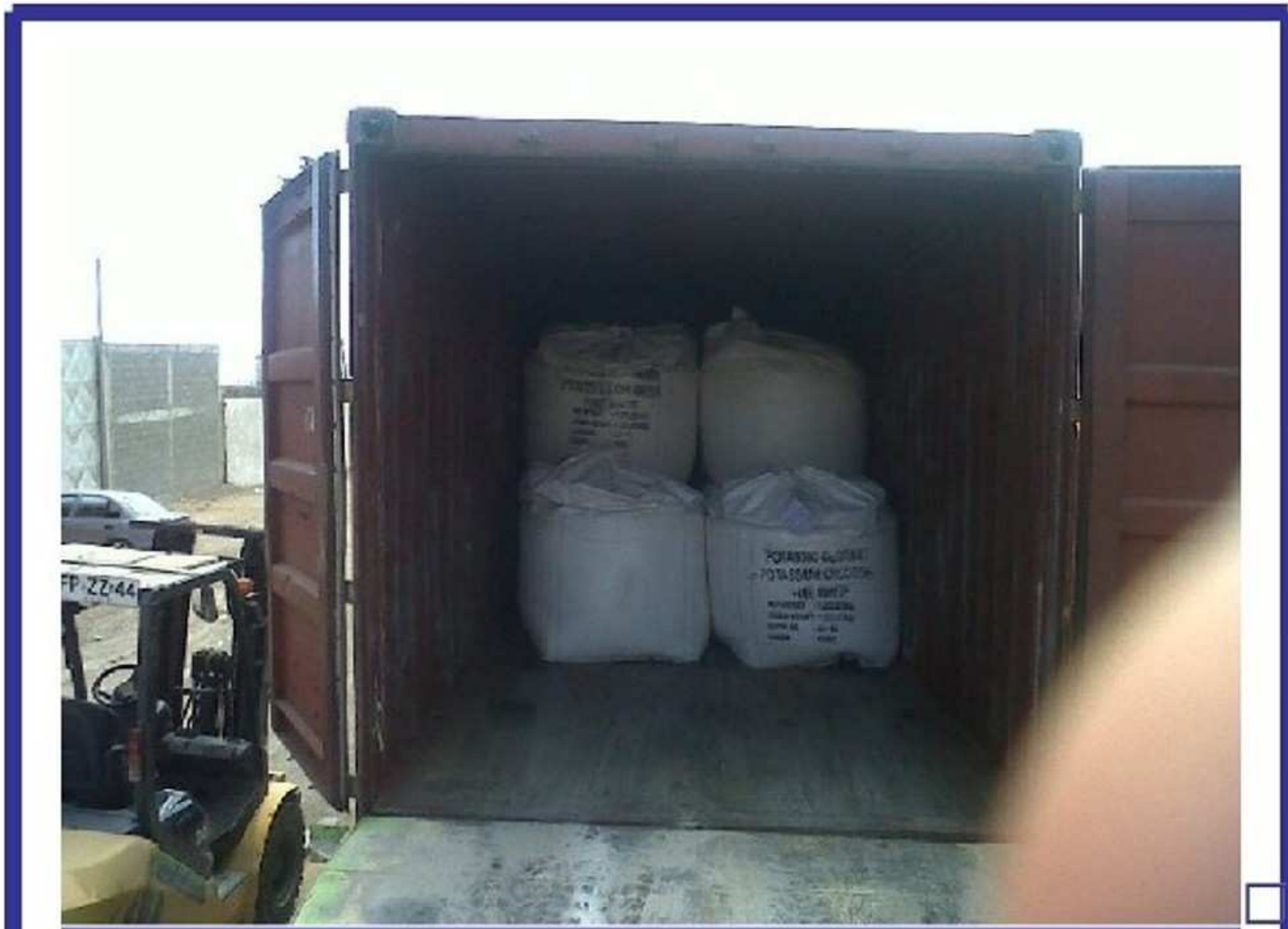
Middle Stowage of Jumbo Bags.