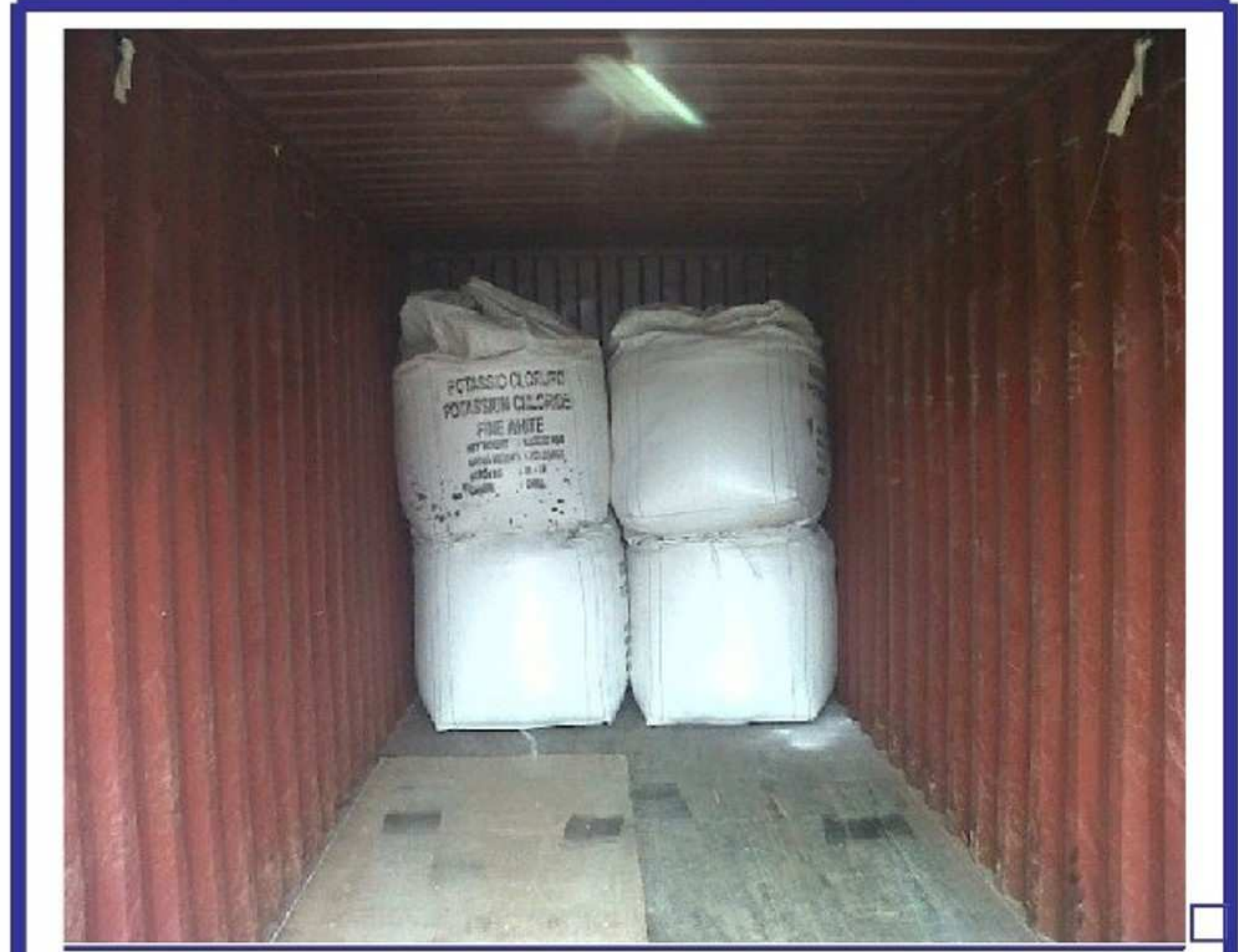
Initial Stowage of Jumbo Bags.