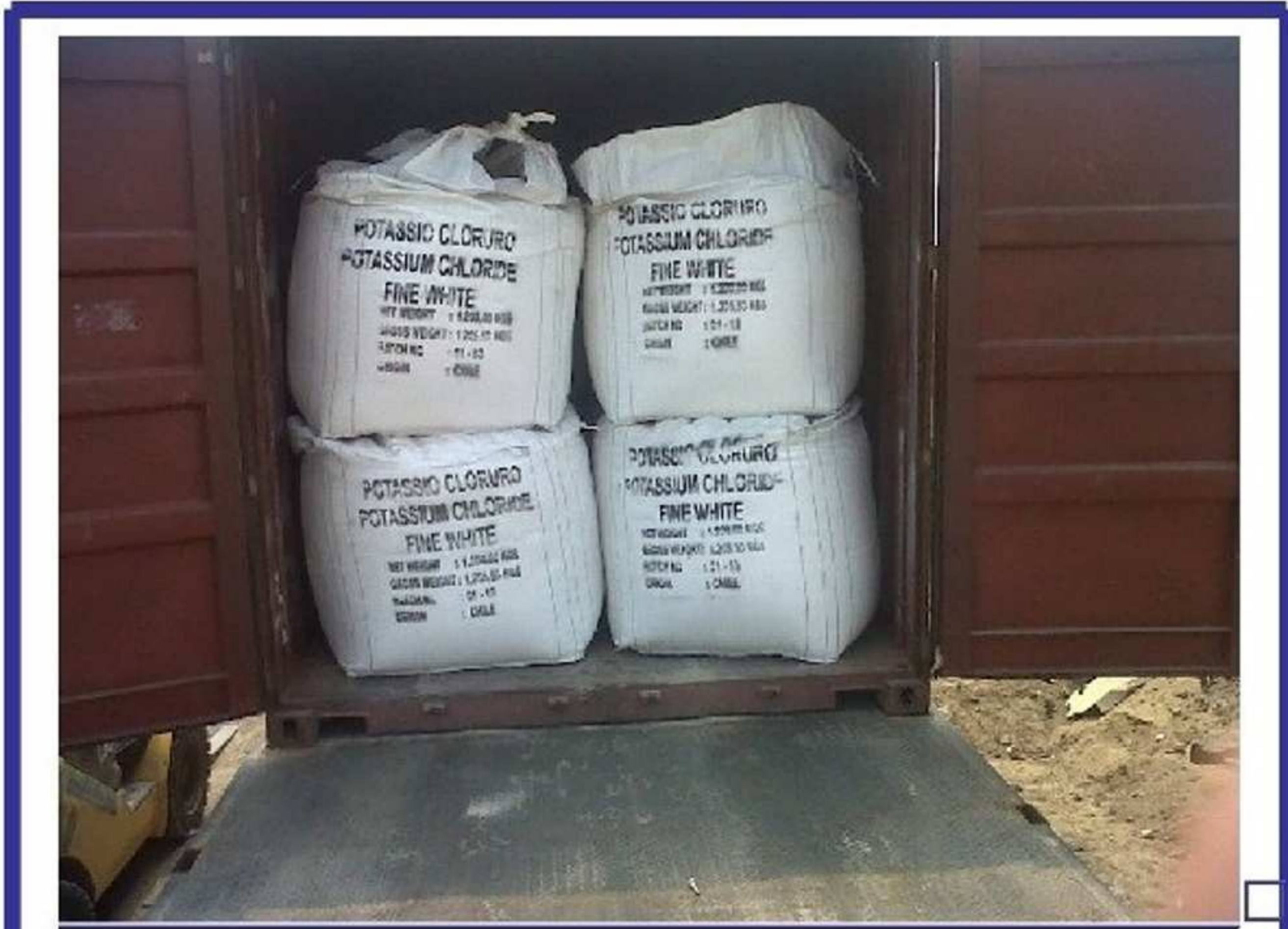
Final Stowage of Jumbo Bags.