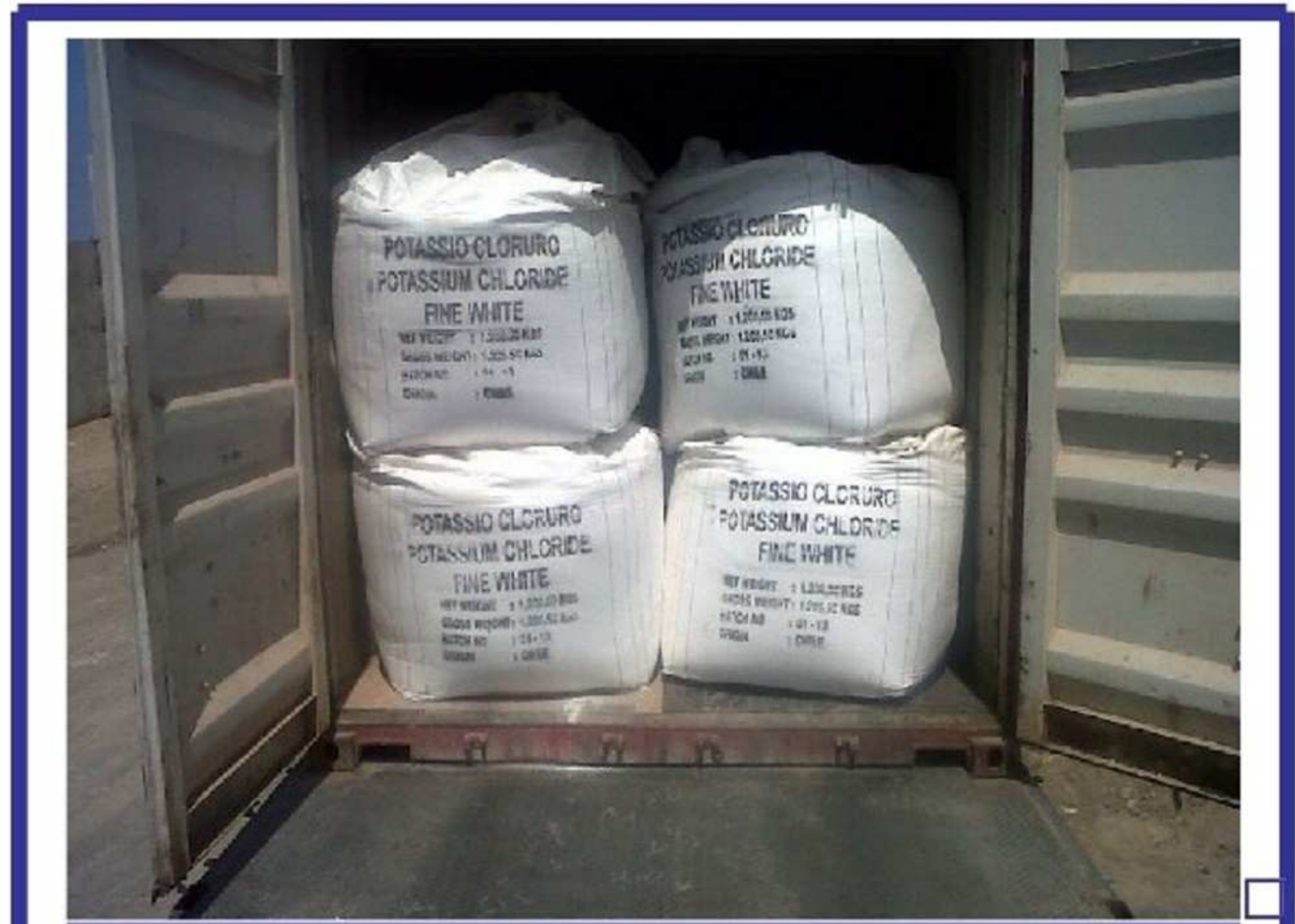
Final Stowage of Jumbo Bags.