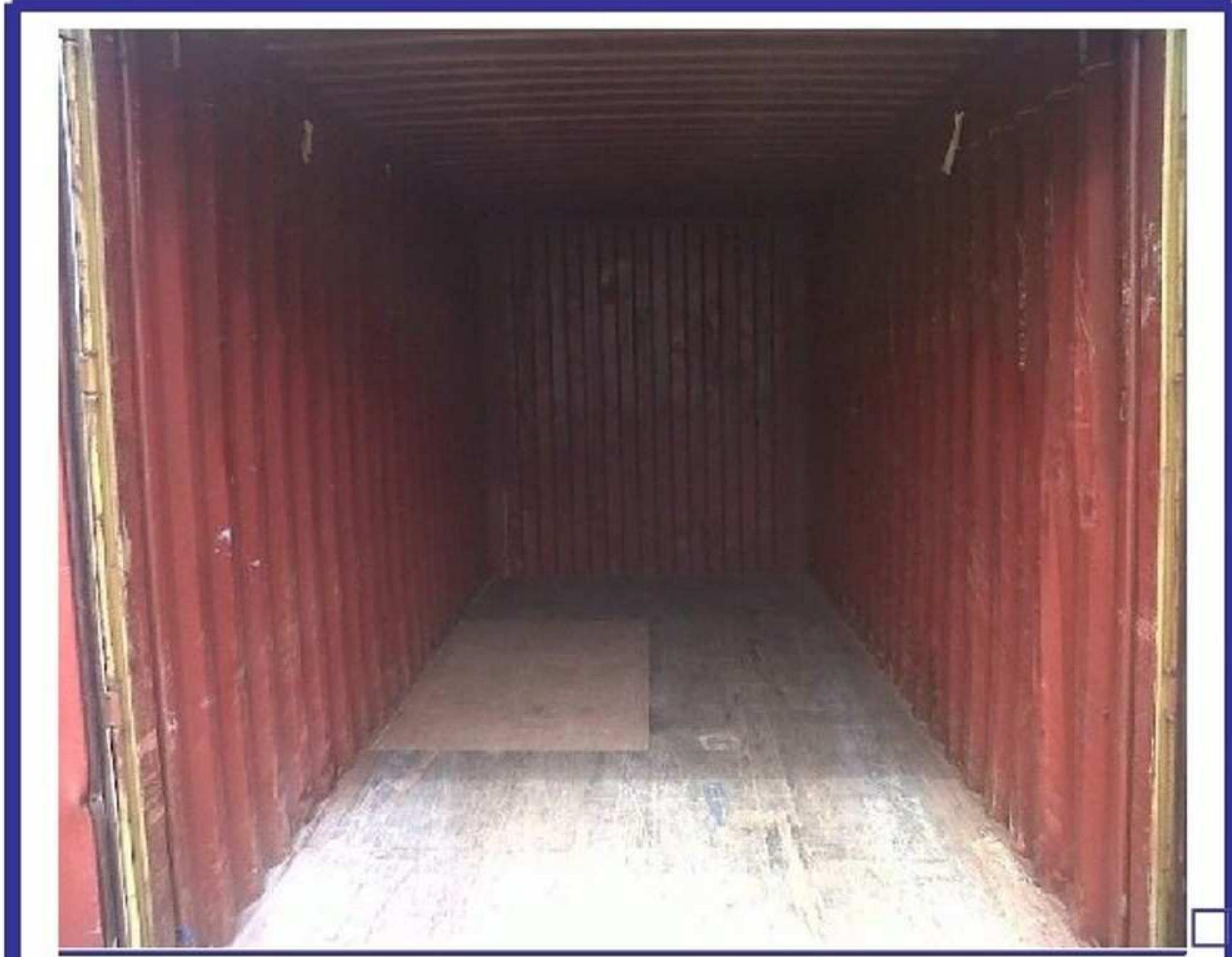
Condition of Container.