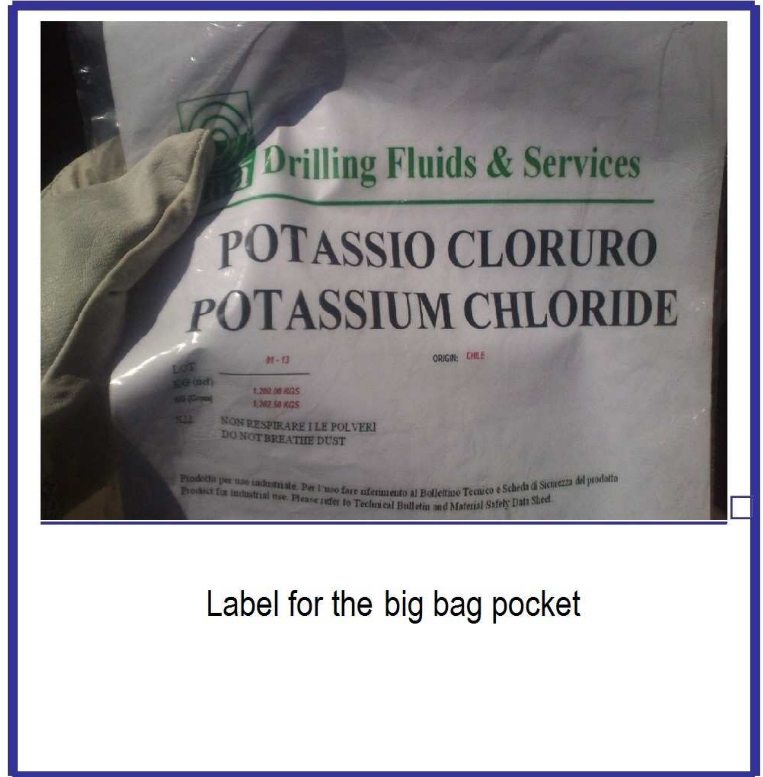
Label for the big bag pocket

Requested by: Messrs. VLG BUSINESS LTDA.